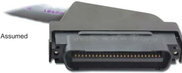
120° Termination Male Only