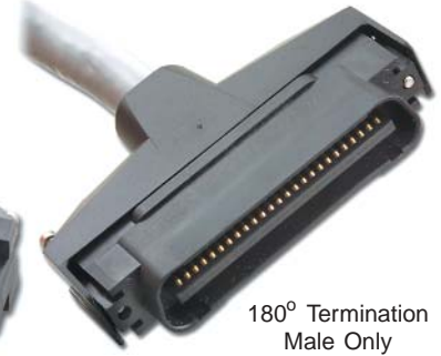
180° Termination Male Only